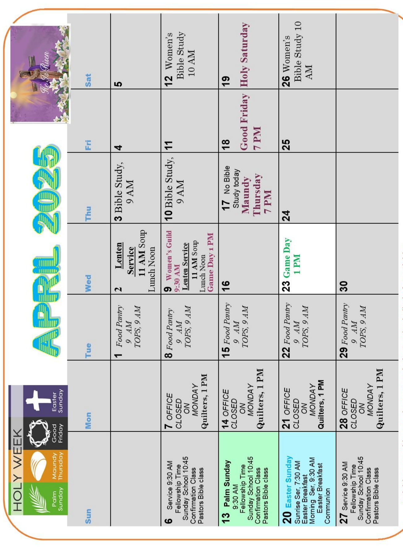
Activities are subject to change watch the Sunday bulletin for activities