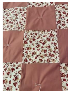
Darlene also enjoys making flannel kids' quilts: