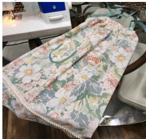
Ilona's girl's dress

First, from the last month's newsletter, the following photo shows an example of the many little girl's pillowcase dresses Suzie and her group have been making. These are to be sent to Africa.