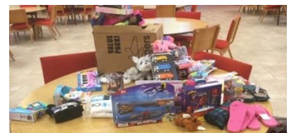
ONE BOX OF MANY BOXES FILLED WITH