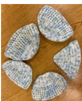
BABY CAPS BY DANI GIFTS

What were the quilters doing in December? I haven't a great number of photos to share but here is what I have: