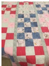
COMPLETED QUEEN SIZE QUILT